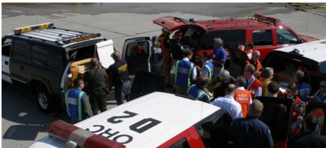
A Unified Command Post is established between the Sheriff's Department, Fire Authority, and John Wayne Airport

On March 2, 2005, many public safety and volunteer organizations participated in a full-scale exercise, in which airport and emergency service organizations responded to victims of a major aircraft disaster. This drill provided an opportunity for those organizations to interface under a unified command structure during an airport emergency setting, and also satisfied FAA requirements of conducting a triennial emergency exercise. After a normal departure from JWA, the pilot of a Boeing 737-800 is