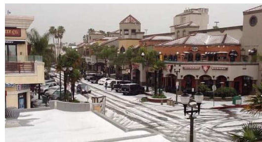
Hail covered streets in Huntington Beach.

NWS San Diego activated all SKYWARN, including Orange County SKYWARN, at 1030 hours on Monday, March 2, 2015. At 1020 hours, NWS showed a cluster of strong thunderstorms stretching from Oceanside to Huntington Beach. Storm weather spotters reported pea-size hail with these storms. At 1100 hours, NWS issued a flash flood warning for northeastern Orange County and western Riverside County, with heavy