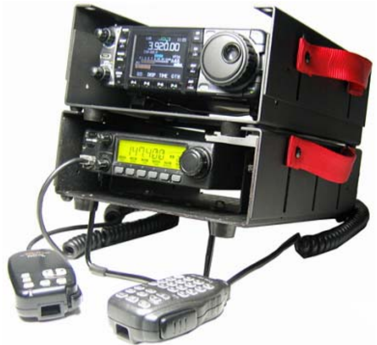
TRC-1 carriers are designed to stack one on top of another

The TAC-COMM Web site at http://www.tac-comm.com features the TRC-1 Tactical Radio Carrier, which is a universally adjustable aluminum carrier designed to hold, organize, protect, and adapt a mobile radio and accessories to portable use in tactical operations. A radio may be mounted in the carrier with the supplied machine screws and nuts or with optional web strapping. The radio, microphone, and power cable may be kept packed, ready for deployment. The TRC-1 provides table-top or car-hood operation with tilt bail and stacking of multiple radios and/or power supplies. Adjustable sides of the TRC-1 accommodate radios of different heights, and can be extended to accept a radio and a TNC or other device in a single carrier. A radio and tuner or radio and power supply or radio and TNC may be strapped and stacked in one TRC-1, provided the combination does not exceed a height of 4.8 inches when the sides of the TRC-1 are fully extended. When the sides are fully collapsed, the height is 2.6 inches. The inside of the carrier is 10.5 inches long and 7.5 inches wide.