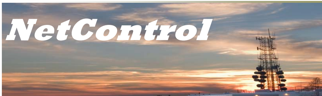
Newsletter of the County of Orange Radio Amateur Civil Emergency Service