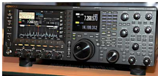
Kenwood TS-990S HF/6-m transceiver.

Kenwood introduced the TS-990S full-size HF/6-m transceiver. It includes a dual-watch receiver with dual TFT display, built-in spectrum scope, switching power supply, and automatic antenna tuner. Power output is adjustable from 5 watts to 200 watts. Modes include SSB, CW, FSK, PSK, FM, and AM. It also includes a COM port, USB A/B port, and Ethernet LAN port.