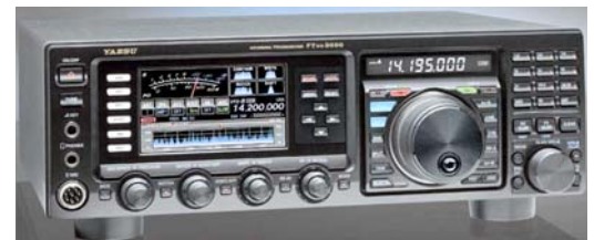
Yaesu FTDX-3000 HF/6-m transceiver.

Another HF/6-m transceiver, the FTDX-3000, was unveiled by Yaesu. The mid-range-priced transceiver features a down-converting receiver based on the high-end FTDX-5000, and includes a built-in spectrum scope. A listening watch on the transmit frequency is provided during split-frequency operation. Three antenna ports include one that can be assigned to a receive-only antenna. Yaesu also showed a prototype of their FT1D 12.5-kHz C4FM FDMA digital handheld. It transfers data at 9.6 kb/s. A GPS antenna is built in. An optional mic includes a camera.