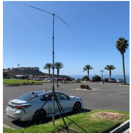
Sgt. Bob McFadden, KK6CUS, checked the 2-m and 70-cm repeaters from Strand Beach in Dana Point and contacted the OC EOC via 60-m NVIS (using a dual-Hamstick dipole) and via Winlink with a Kenwood HT and laptop.