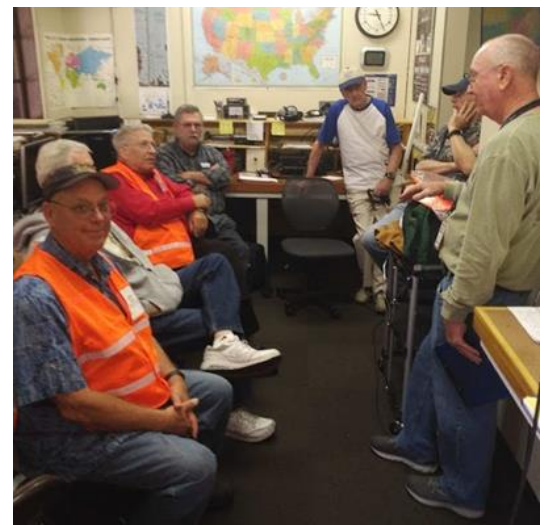
Laguna Woods RACES net control at the Clubhouse 1 radio room during the City/County RACES & MOU deployment exercise.

OCRACES Applicant Mark Warrick, KM6ZPO, operated the 60-meter station at the OC EOC, with a lot of activity on "channel 4" (5371.5 kHz upper sideband, which is the same frequency used on the weekly Saturday morning OCRACES 60-meter nets). He communicated with other OCRACES members in the field (KK6CUS at Dana Point, N6PRL mobile on Ortega Highway, and N2VAJ at Belmont Park in Orange), and with Brea RACES (W6RUW in Carbon Canyon, as well as KM6BRC and K6UDW), Fountain Valley RACES (N6NQN), IDEC (N6IPD), Laguna Woods RACES (K6EEE), Mission Viejo RACES (W6EDT and KJ5KG), Newport Beach RACES (NI6E at Corona Del Mar, K6GSX at Signal Peak and at Crystal Cove, and K6GVG). Other 60-meter contacts included Cal OES CRU (W6GMU), Ventura County ACS (N6WIX), Nye County EmComm in Pahrump, Nevada (KE7KHE), a couple of stations in Orange (WD6AJR and KB6KPK), and a station in Seal Beach (K6BUW). When communications were poor between stations in Orange County, relays were effective through the stations in Ventura and Pahrump.